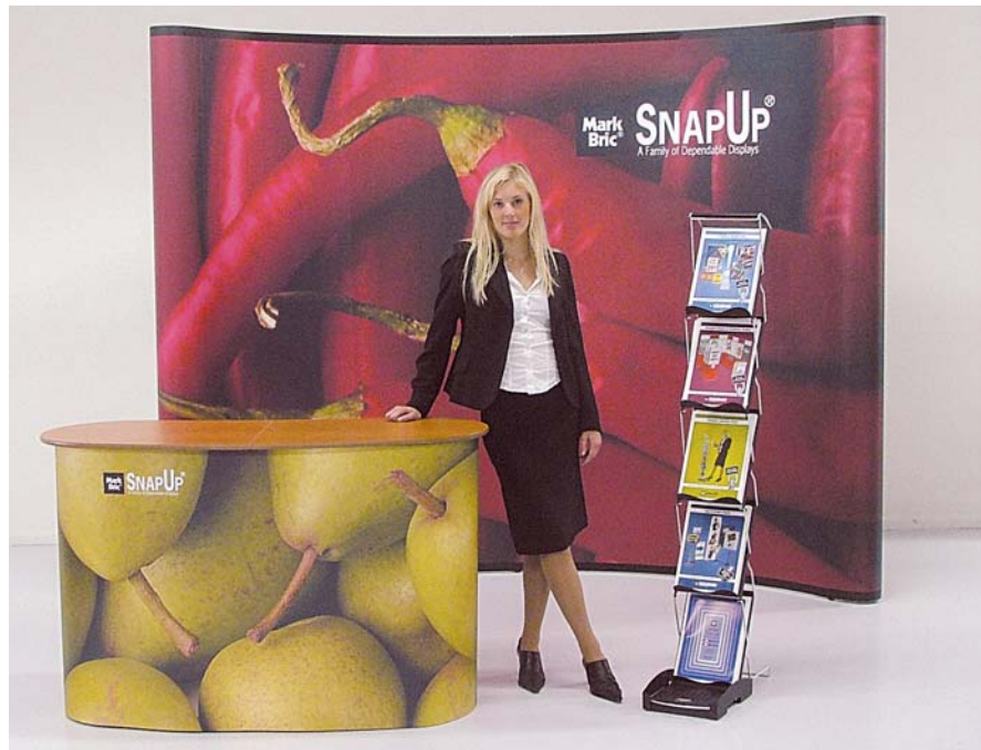
1 SnapUp Mp1 4x3 Backwall + SnapUp Reception desk + SwingUp Literature rack Size of backwall: 2875 (w) x 2255 (h) x 840 (d) mm. Size of reception desk: 1410 (w) x 895 (h) x 580 (d) mm.