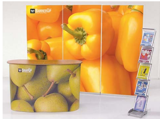
3 3 pcs. BannerUp PLUS, 88 cm (connected) + SnapUp Reception desk + SwingUp Literature rack Size of BannerUp backwall: 2640 (w) x 2120 (h) x 150 (d) mm. Size of reception desk: 1410 (w) x 895 (h) x 580 (d) mm.