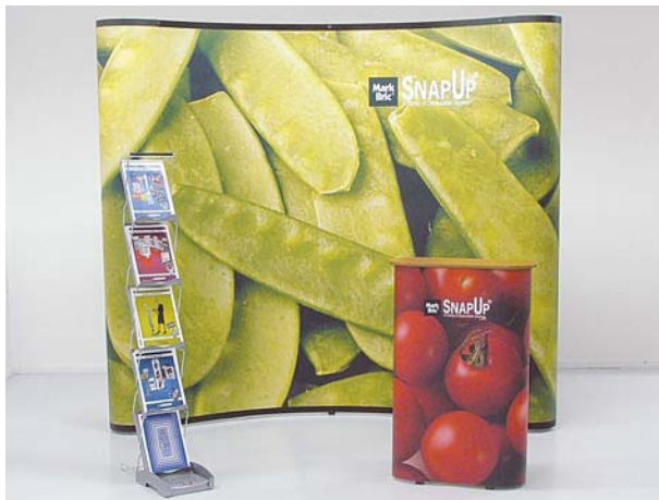
2 SnapUp MP2 3x3 Backwall + SnapUp Mini-counter + SwingUp Literature rack Size of backwall: 2550 (w) x 2225 (h) x 720 (d) mm. Size of mini-counter: 685 (w) x 1035 (h) x 295 (d) mm.